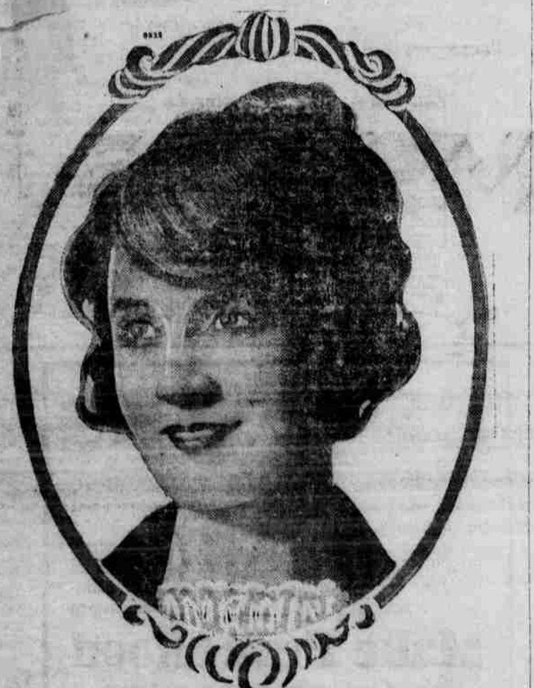
BILLIE BURKE "The Misleading Widow" at Government Theatre