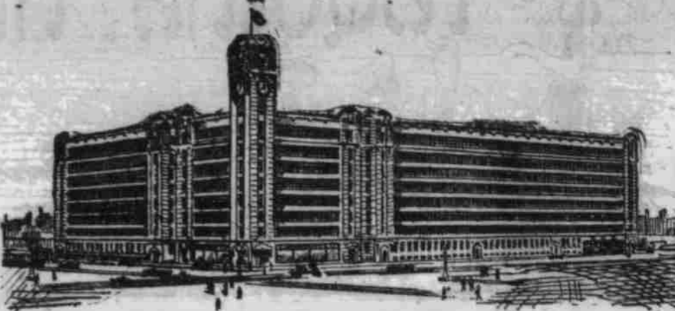
NEW WRIGLEY CHEWING GUM FACTORY, CHICAGO

MADE POSSIBLE—AND NECESSARY—BY ADVERTISING