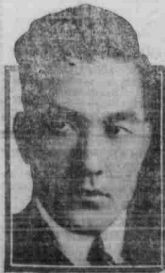
Sessue Hayakawa Hayakawa Musical Star.