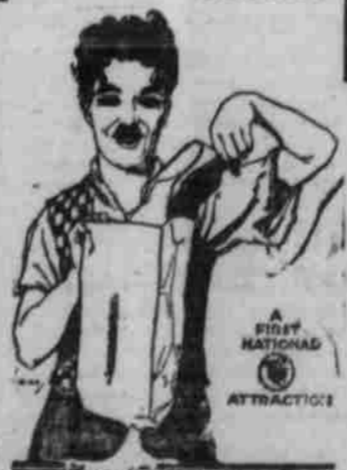
Charlie Chaplin SUNNYSIDE

COMING-- From farm hand to merchant prince -- a visit to the fairies-- how to win a maiden's love--how to be happy though hired-- A REVELATION Of Farm Life as it Should be by that Master Teacher YE LIBERTY Starting SUNDAY