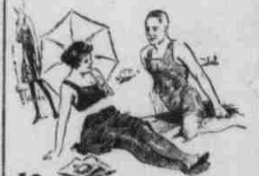
At the seaside too, the plump rounded figure is most admired.