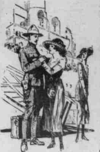
Our soldiers always pick out the plump, rosy checked girls.

CAUTION—While Bitro-Phosphate is unsurpassed for the relief of nervousness, general debility, etc., those taking it who do not desire to put on flesh should use extra care in avoiding fat producing foods.