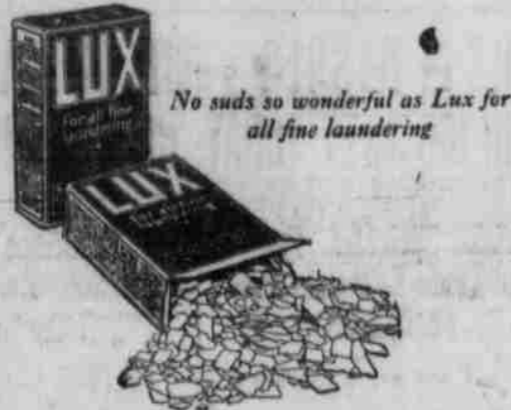
No suds so wonderful as Lux for all fine laundering

that dissolve instantly in hot water and whisk up into a wonderful lather. Your grocer, druggist or department store has Lux. Lever Bros. Co., Cambridge, Mass. Lux will not harm any material that pure water alone won't injure. To wash men's silk shirts Use one tablespoonful of Lux to a gallon of water. Dissolve in boiling or very hot water; whisk up into a thick lather and add cold water to make the suds lukewarm. Put the garment in, work it up and down, and squeeze the suds through it. Do not rub. Rinse three times in water the same temperature as the water in which you washed it. Roll in a towel to dry. While still damp, press with a warm iron, on a well-padded board. Pongee should be ironed when entirely dry.