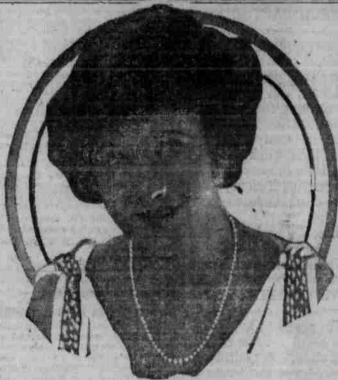
MARGUERITE CLARK "Let's Elope" A Paramount Picture AT THE OREGON SUNDAY, MONDAY