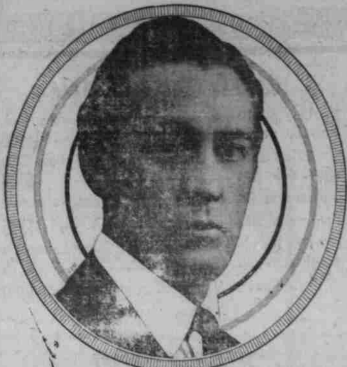
JOHN BARRYMORE starring in Princess Patricia