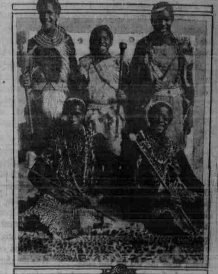
Kaffir Singers for Centenary Celebration

Summer furs are no novelty to the smiling young persons from Kaffirland, who are shown featuring the expensive leopard-skin and other valuable fur costumes.