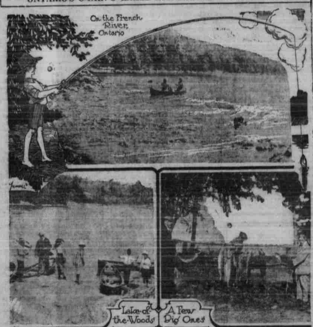
Lake-of-the-Woods A Few Dig Ones

French River, Nipigon, Lake-of-the-Woods, Ontario. These are names that arouse enthusiasm in the breasts of a great number of American fishermen who cross over to Canada every year for a season of cool-satisfying sport.