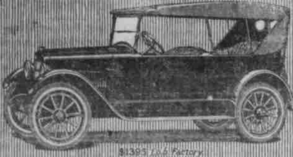
$1395, 7000 Factory