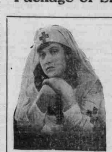
The Sphagnum Moss Girl

To Introduce these SFAG-NA-KINS Special Price for Package of Six - 19c