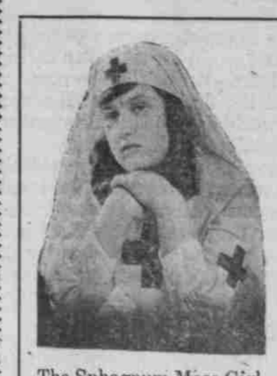
The Sphagnum Moss Girl

SFAG-NA-KINS A Sphagnum moss sanitary napkin The "Sfag-na-kins" will be found to prove greatly superior to anything else on the market