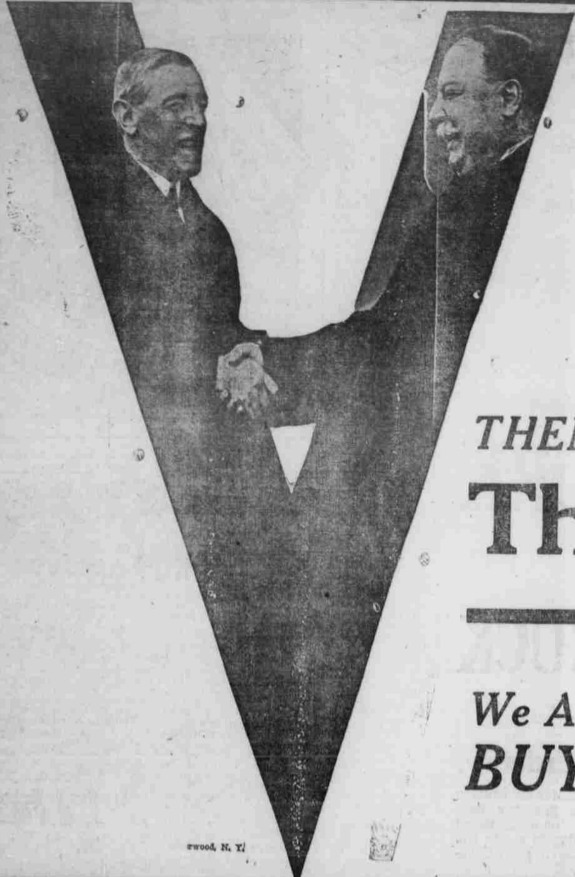
Wood, N. Y.