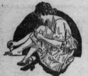
"3 drops of 'Gels-It'—Corn is doomed."

There's Only One Gentle Corn Peeler—That's "Gels-It!" There's only one happy way to get rid of any corn or callus, and that's the painless peel-off way. "Gels-It!" is the only corn remedy in the world