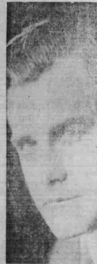
BERT LYTELL YE LIBERTY

Pupils and high school students who hope to compete in writing a good liberty loan story are advised that the subject on which they are to write is "Victory—What Price?" It is suggested that the pupils might write on the sentimental side as well as the business view of the situation. Children in the first and second grades are barred out. Those in the third and fourth grades are limited to 200 words. Those in the fifth and sixth grades to 400 words and those of the seventh and eighth and even higher grades must confine their writing to 1000 words or less. Each teacher selects the best essay, then the principal of the school selects the best and then the county superintendent is to pick out two of the best in the county. These are forwarded to the state committee. To the pupil who writes the best essay in the state will be given a German helmet. The next best ten will each be given a silver pin. Essays must be written and handed to the teacher by April 21.