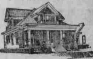
A No. 4-21W IDEAL Boiler and 422 Ft. of 38-in. AMERICAN Radiators, costing the owner $345, were used to heat this cottage. At this price the goods can be bought of any reputable, competent fitter. This did not include cost of labor, pipe, valves, freight, etc., which vary according to climatic and other conditions.

Public Showrooms at Chicago, New York, Boston, Providence, Worcester, Philadelphia, Pottsville, Newark, Wilkesbarre, Baltimore, Washington, Richmond, Albany, Syracuse, Rochester, St. Paul, St. Louis, Kansas City, Des Moines, Omaha, Denver, San Francisco, Los Angeles, Seattle, Spokane, Portland, Toronto, Brantford (Ont.).