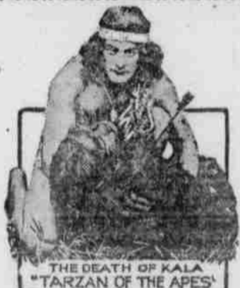
THE DEATH OF KALA "TARZAN OF THE APES"

Portland to the Bay country, everywhere noting parks, private grounds, and exhibitions. Hence he seemed to be entitled to respect in his opinions, the gist of which is set down here— with the name withheld: