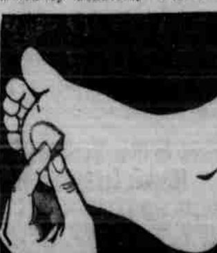
Callus Comes Off Like Banana Peel

But what will please you most will be after a few weeks' use when you will actually see new hair—fine and downy at first—yes—but really new hair growing all over the scalp. If you care for pretty, soft hair and lots of it, surely get a small bottle of Knowlton's Danderine from any druggist or toilet counter for a few cents.