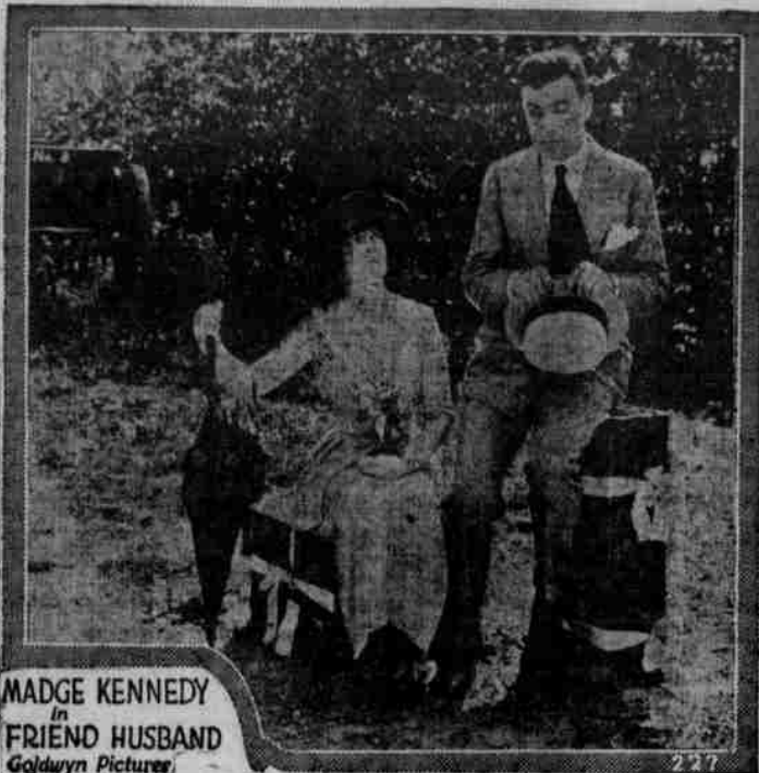
MADGE KENNEDY FRIEND HUSBAND Golden Pictures

The Ye Liberty Theatre will be thrown open to all men wearing service stripes all day Saturday. Matinee and evening. The feature is Madge Kennedy in "Friend Husband."