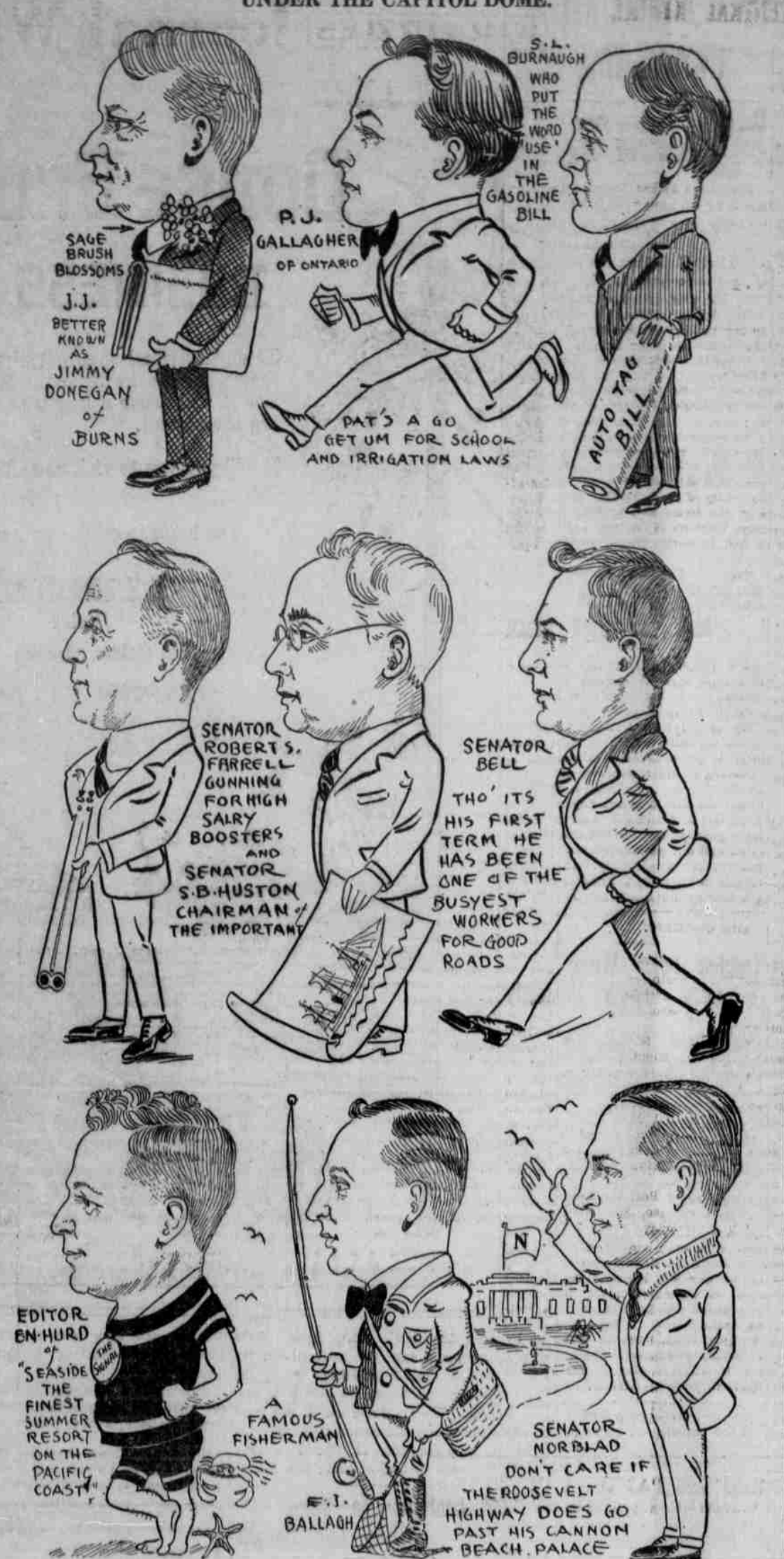
room for making candles. Pupils can go These senators and representatives are taking part in the grand rush to clear the calendar now on in both houses.