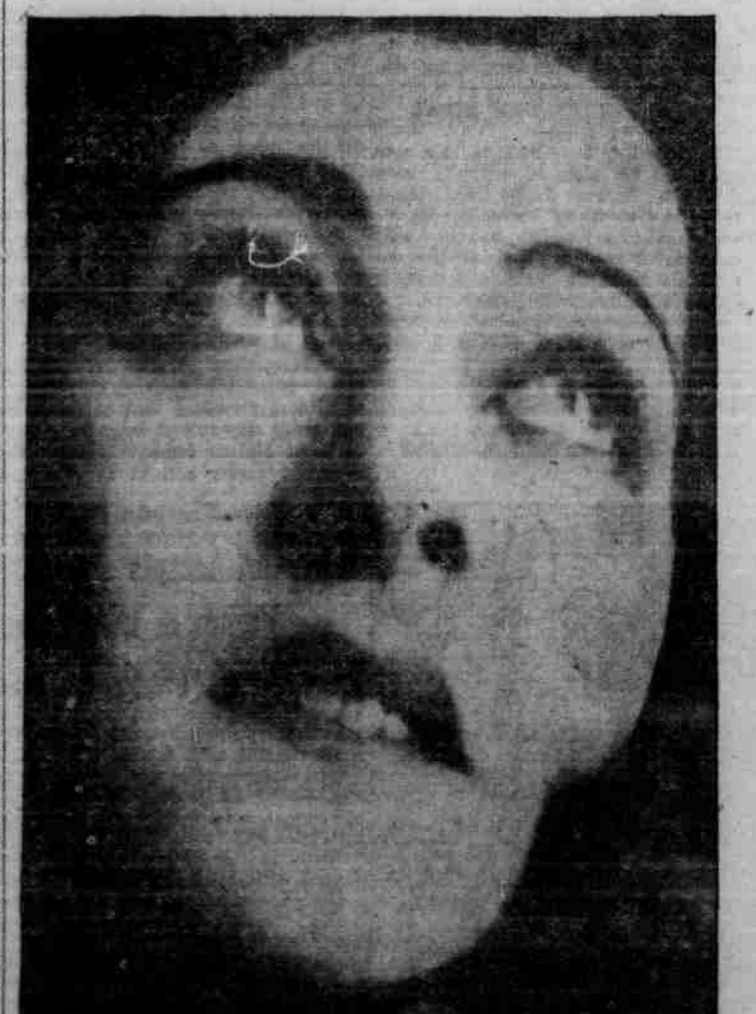
N • A Z I M O V A

***** SPECIAL SINGER SEWING MACHINES * Rented or Sold for 10c Per Day * * We do Hemstitching * * 337 State St. Salem, Oregon * *****