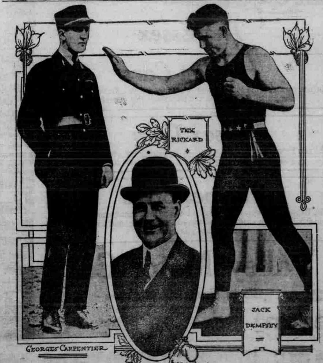
PROMOTOR AND HEAVYWEIGHTS IN THE PUGILISTIC LIME LIGHT—Jack Dempsey was chosen as Wildard's opponent in championship bout. Georges Carpentier will more than likely be matched with the winner.