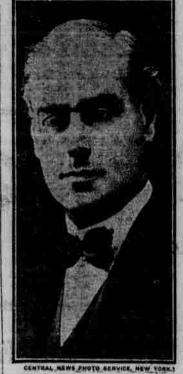
Sir Arthur Pearson, the famous English publisher, who is in this country to advise in work of training afflicted American soldiers maimed by Hun gasmen. Sir Arthur is Britain's most loved blind man.