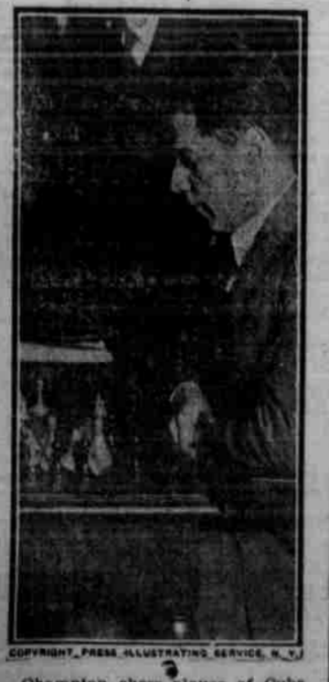
Champion chess player of Cuba now in the United States.