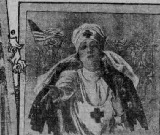
HARRISON FISHER POSTER