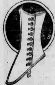
SPATS $3.50 AND $1.65