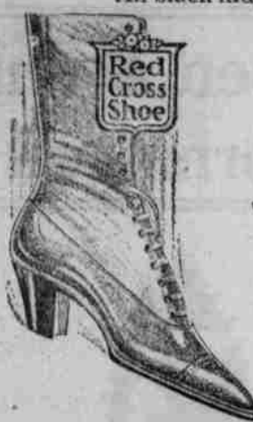
Cuban And Military Heels

Red Cross, dark grey, cloth top, $10.50 quality, at $7.95 Red Cross, light brown, cloth top, $10.50 grade, at $7.95 All dark grey kid, high grade $12.00 value, sale price $9.65 Light grey kid, cloth top, fine $8 shoes, for $5.95 Dark grey kid, cloth top, $7.00 values at $5.65 Dark brown Russia calf, worth $12.00, special $8.95 Dark brown kid de luxe, fine $9.50 value for $7.35 Dark brown kid, cloth top, excellent $7.50 grade $5.65