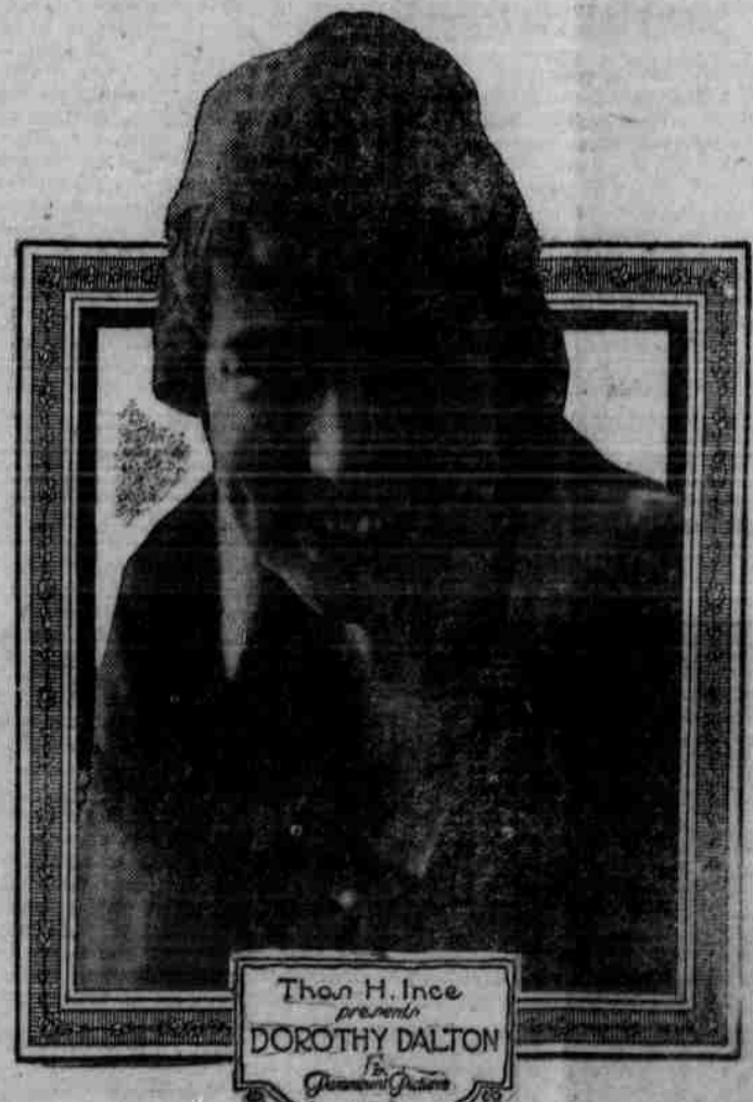
Than H. Ince presents DOROTHY DALTON in "Vive La France" At The Oregon Theatre on Friday and Saturday of this week.