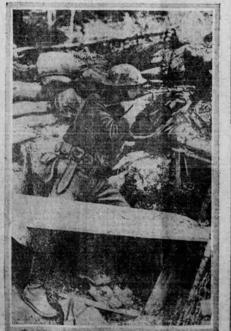
AN AMERICAN SNIPER AT WORK—This official photo shows an American rifleman drawing a bead through a telescope sight upon a German out-post.

tion in the state to issue a Xmas edition. It comes out in an enlarged form displaying in colors the American flag. In putting out the Christmas number so early it was figured that for the boys over there, it will be delivered about the time lodge members of the service are thinking of Christmas doings at the lodge.