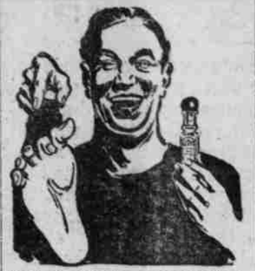
No More Excuse for Corns or Corn-Pains Now!

There's Only One Genuine "Corn-Feeler"—That's "Gets-It" Ever peel a banana? That's the way "Gets-It" peels off corns. It's the only corn treatment that will "Gets-It" is a guarantee that you won't find