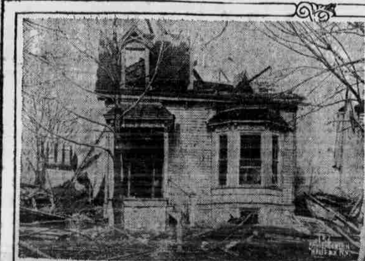
In the Path of the Blast