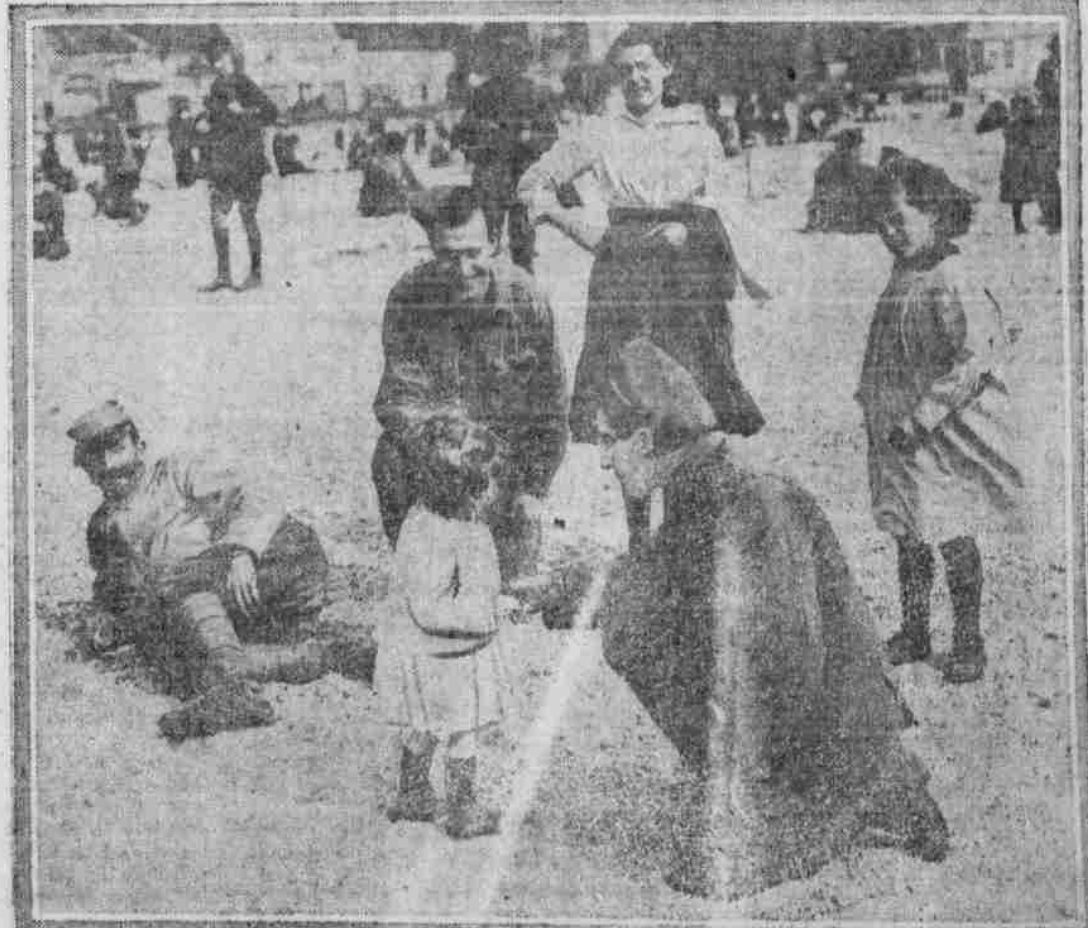
AMERICAN DOCTORS AND NURSES WITH THEIR WOUNDED PATIENTS—American doctors and nurses with a few of their wounded patients' somewhere in France.