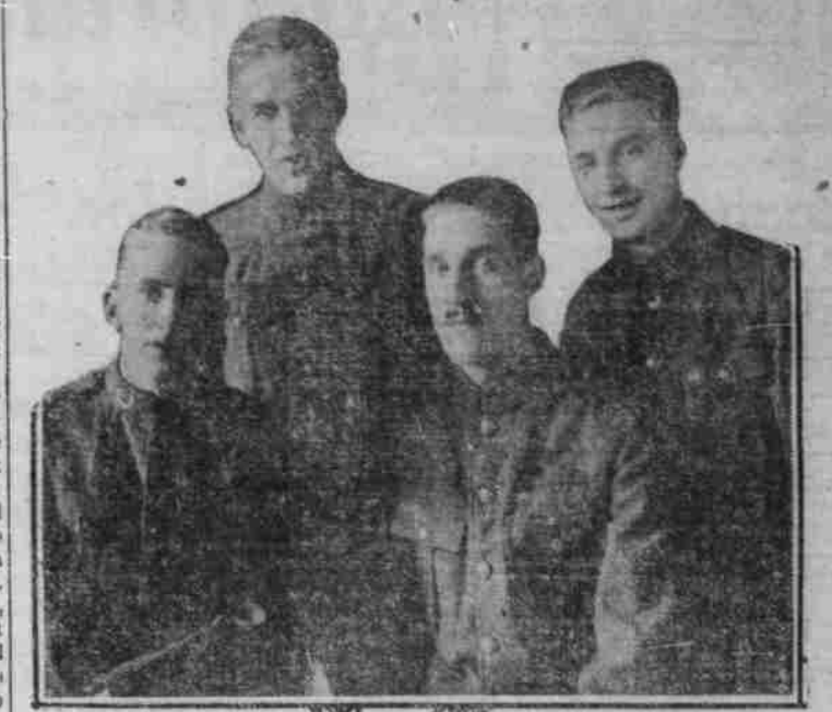
Four Hun Chasers, From "Over There," at the Hippodrome.

THEY TELL WHO THEY ARE and WHAT THEY HAVE DONE WAR SONGS STORIES COMEDY ---Special Scenery--- OTHER ATTRACTIONS TOO