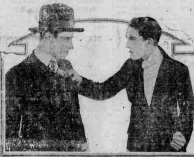
JACK PICKFORD in "SANDY" A Paramount Picture