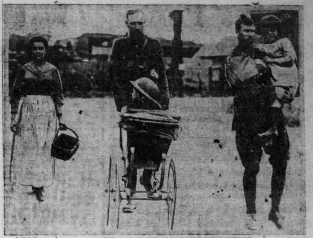
CHILDREN WITH STEEL HELMETS--THE LAST INHABITANTS, LEAVE THEIR DOOMED VILLAGE--Fearing that the German forces would come within the range of their village on the western front the inhabitants gathered what belongings they could and escorted by British military police evacuated their homes and were taken to places of safety.

The institutions are asking for new buildings and improvements to the total amount of $494,750. The penitentiary, the institution for feeble minded and the eastern Oregon state hospital are making big requests for new buildings.