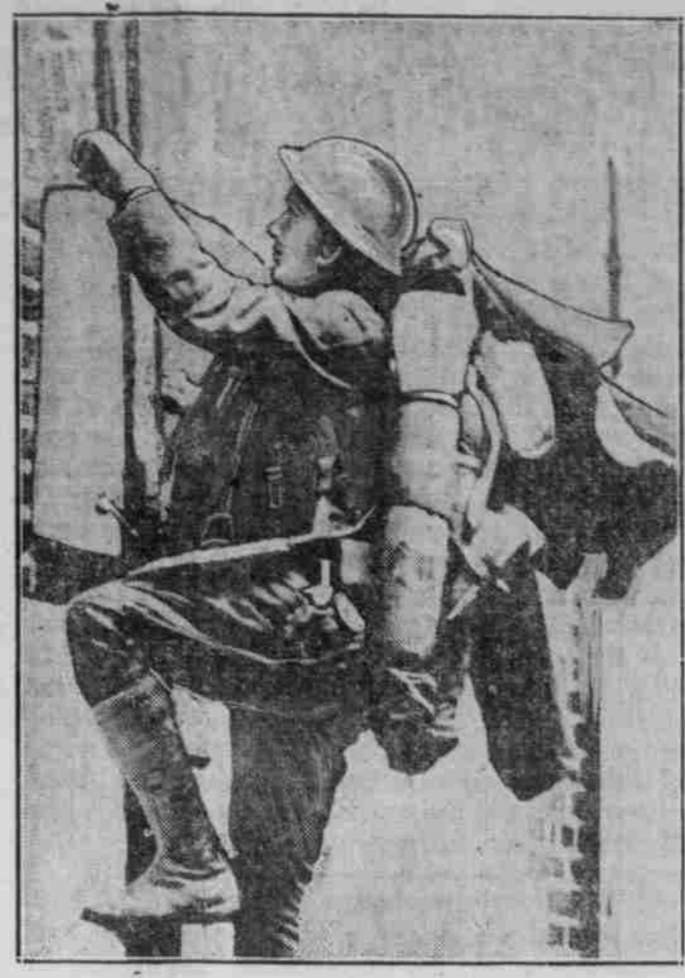
WITH THE AMERICAN TROOPS IN FRANCE—Soldier climbing into bivouac after day's hike. Note his full equipment.

Many inquiries, some of them thoughtless in nature, are directed to the food administration regarding the sugar limitation put upon all. Many persons ask why the Food Administration does not close the confectionery stores so that sugar used in candy making and ice cream, etc., may be saved.