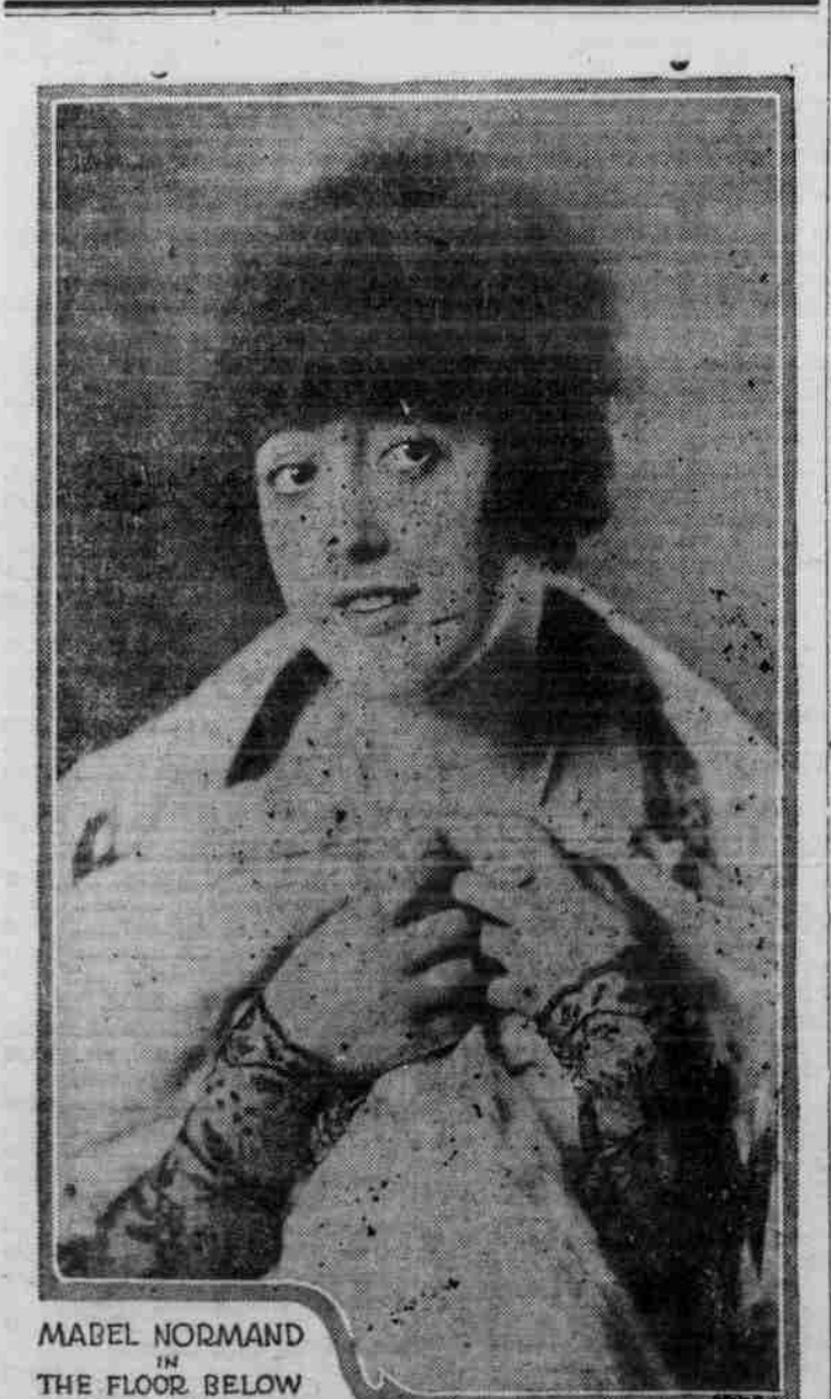
COMING TO THE LIBERTY FOR THREE DAYS STARTING NEXT