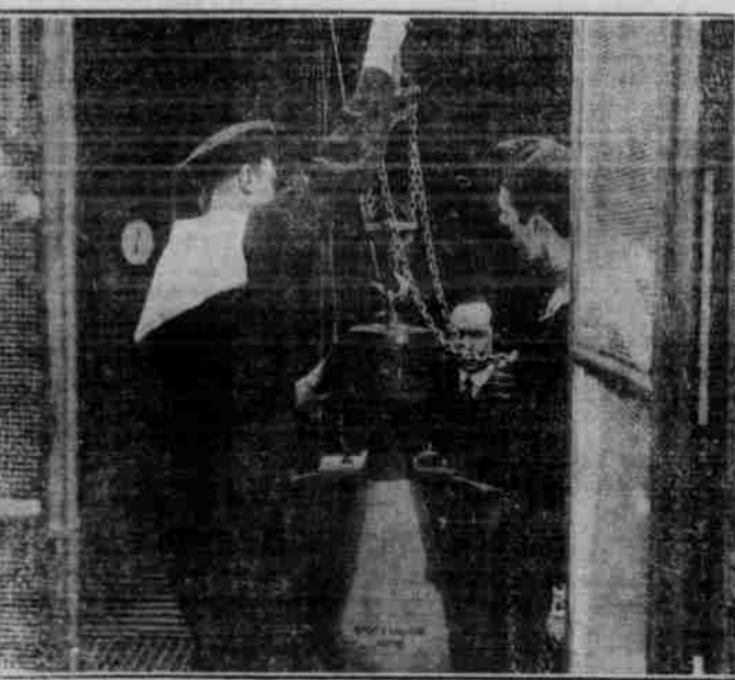
RELEASING THE BOMB—THE ZEPPELIN'S LAST RAID. SHOWING AT THE LIBERTY THEATER TODAY