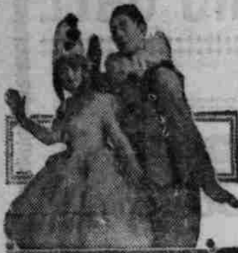
MARGUERITE CLARK in "Prunella" A Paramount Picture