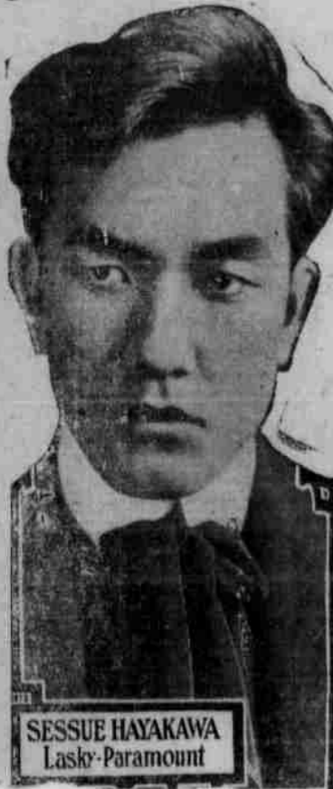
SESSUE HAYAKAWA Lasker-Paramount