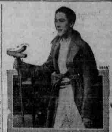
JACK PICKFORD in Mile-A-Minute Kendall