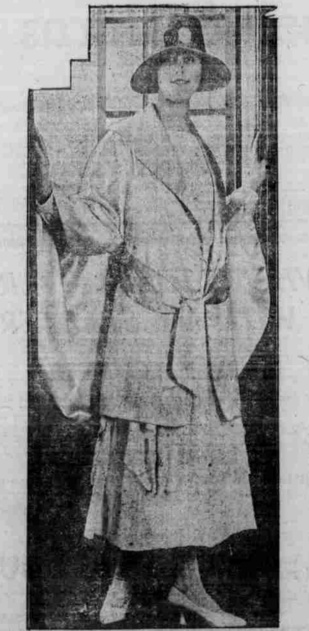
NEWEST FASHION HINT—Slip-on cape ideal for a light wrap. It is pale grey satin lined with Alice blue, hat of blue ribbon with French knots and flower of wool and silk.

Directions of Special Value to Women are with Every Box. Sold by druggists throughout the world. In boxes, 10c., 25c.