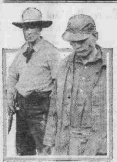
Wm. S. HART of "Wolves of the Rail" An AIRCRAFT Designer

No more snuffing, hawking, mucous discharge, dryness or headache; no struggling for breath at night. Get a small bottle of Ely's Cream Balm from your druggist and apply a little of this fragrant antiseptic cream in your nostrils. It penetrates through every air passage of the head, soothing and healing the swollen or inflamed mucous membrane, giving you instant relief. Head colds and catarrh yield like magic. Don't stay stuffed-up and miserable. Relief is sure.