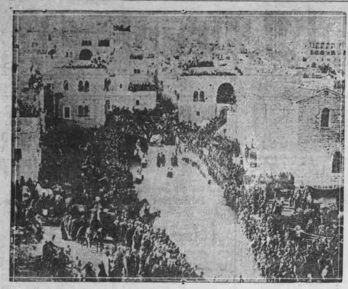
CHRISTMAS DAY IN BETHLEHE W-A DAY OF REAL REJOICING-The entire populace and residents of the cities and villages nearby proceed my to the Church of Nativity for so ema ceremonies. This scene is most