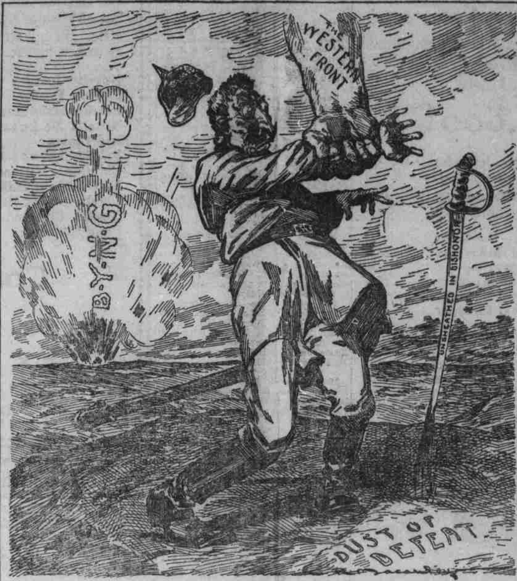
THE DEADLY GRIP Here is where he will be brought to his knees.

The house recessed until this afternoon when the committees appointed to wait on the president will notify him that congress is ready to receive his message.