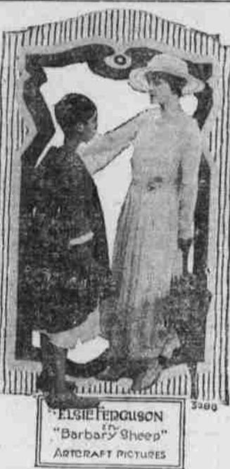
Appearing at the Oregon Sunday, Monday and Tuesday