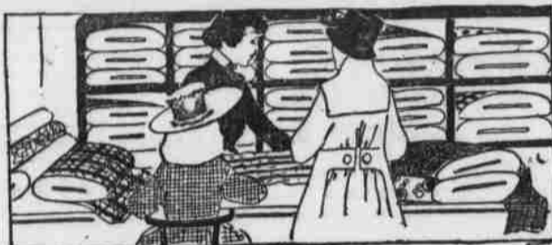
AN IMMENSE STOCK OF CURTAINS, NETS AND SCRIMS.

MAIL ORDERS Will receive prompt and careful attention. Samples sent on application. Payment for full amount must accompany order, but money will be refunded if goods are returned because they were not satisfactory. Address STOCKTON'S STORE Salem, Ore.