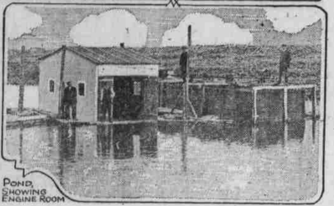
POND SHOWING ENGINE ROOM

It has been estimated by Canadian authorities that while it takes 50 people in the United States to eat a one-pound tin of lobster in a year, 20 people in Great Britain or France will get away with the same amount.