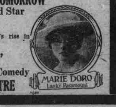
MARIE DORO Lasky Paramount

DOUGLAS FAIRBANKS in "THE AMERICANO" Friday - Saturday THE OREGON