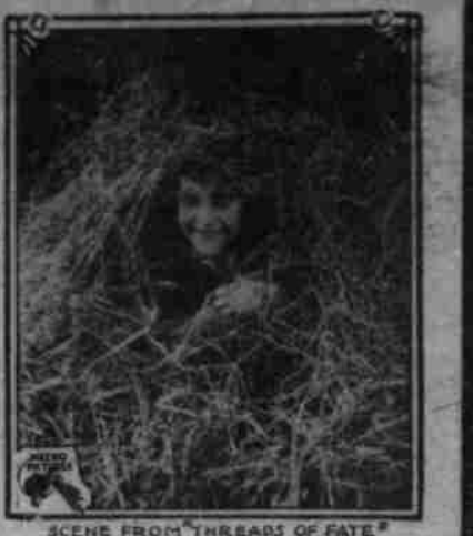
SCENE FROM "THREADS OF FATE"

FRIDAY and SATURDAY DOUGLAS FAIRBANKS in "The Americano"