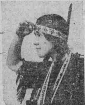
Princess T. Sianina.