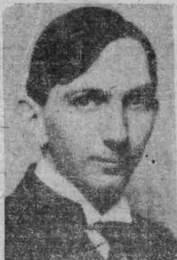
Charles Wakefield Cadman.