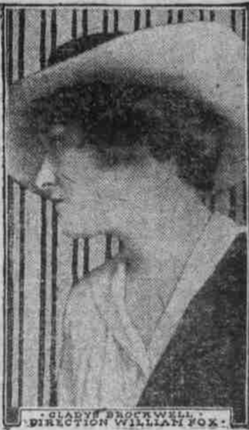
GLADYS BROCKWELL. DIRECTION WILLIAM FOX.