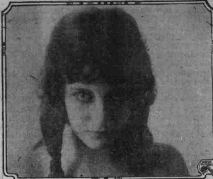
VIOLA DANA IN "THE GATES OF EDEN"