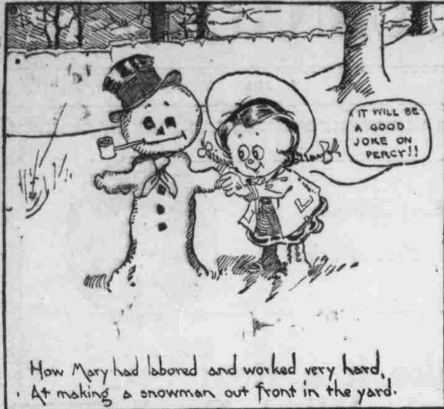
How Mary had labored and worked very hard, At making a snowman out front in the yard.