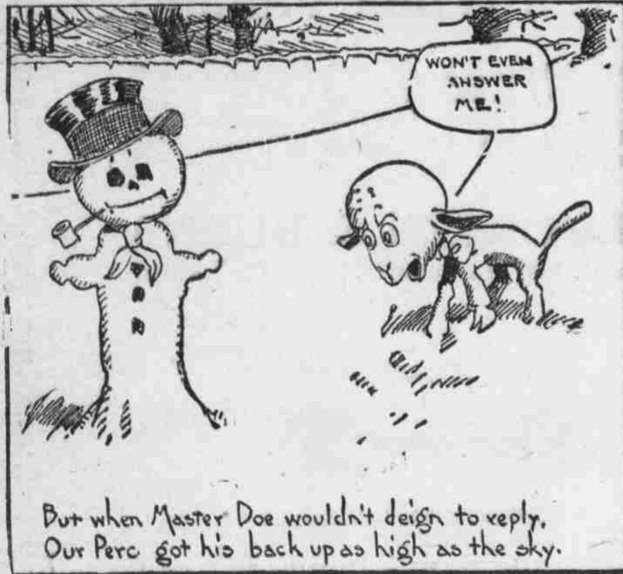
But when Master Doe wouldn't deign to reply, Our Percy got his back up as high as the sky.