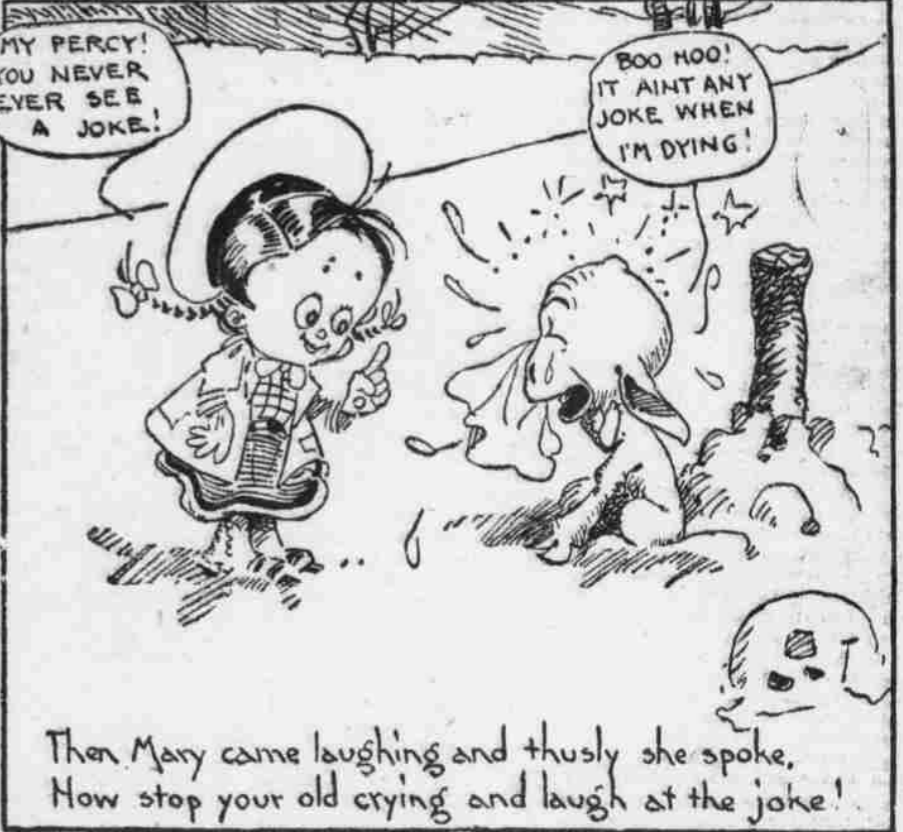
Then Mary came laughing and thushly she spoke, Now stop your old crying and laugh at the joke!