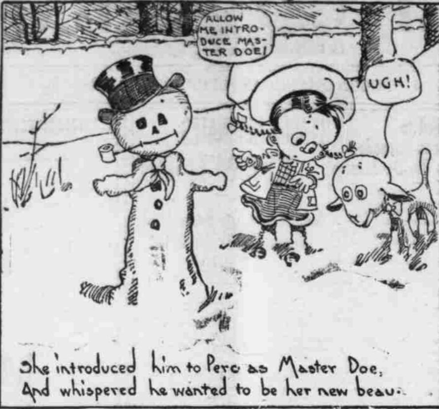
She introduced him to Percy as Master Doe, And whispered he wanted to be her new beau.